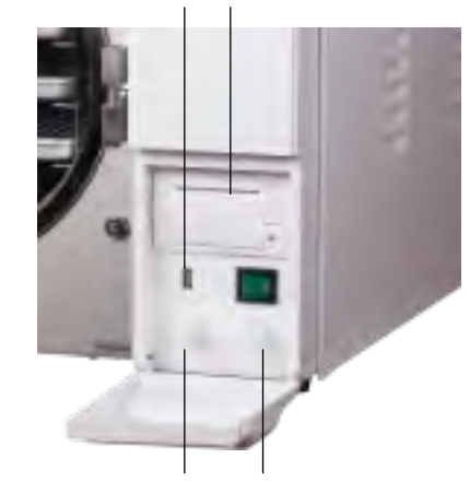
draining connector draining connector for used water tank for flash water tank